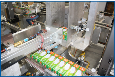
Case loading and collating system on one gantry robot. This ensures a reduction in mechanical components resulting in savings in spare parts and maintenance.