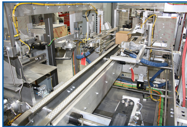
No chains or lugs required on the case transportation system ensuring minimal case damage, faster changeover times, and reduction in spare parts and maintenance costs