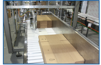
Flat Stack Magazine™ and Cartesian Case Erecting eliminates tabs and pins on the magazine for fast repeatable changeover with no tweaking or adjustments